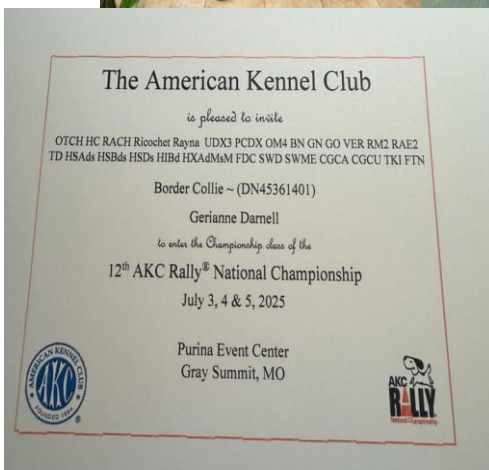
Rayna's Recognition Rally Nationals